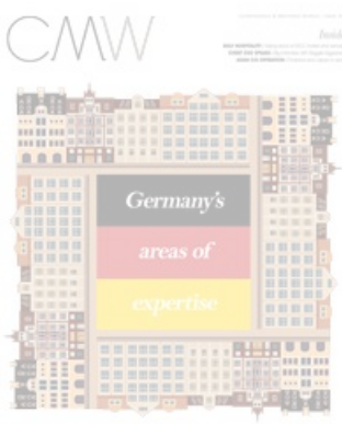
May 2017 - Issue 88